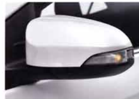
Outer mirror with Aero Stabilizing Fin and side turn signal lamp