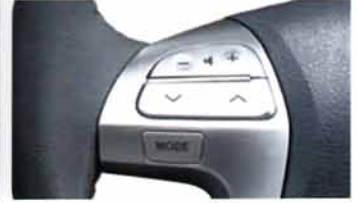
Audio Controls on steering wheel