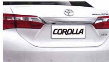
The pronounced rear bumper and sleek rear combination LED taillamps, give the Corolla a wide and sporty appearance.