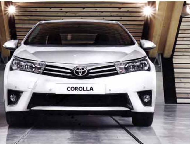
A distinctive front grille gives the Corolla a dynamic new look.