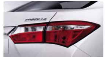
Stylish Tail Lamp