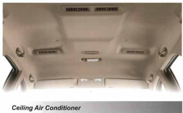
Ceiling Air Conditioner