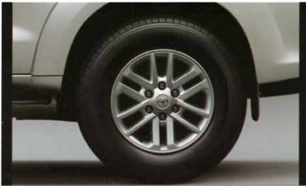
NEW 17" Alloy Wheel

Stay ahead with stylish exterior features that include Front Grille and Bonnet Scoop, NEW LED Daytime Running Light (DRL), Rear Combination Lamps, Retractable Side Turn Indicators, Fog Lamps and NEW 17" Alloy Wheel.