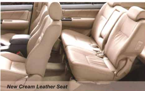
New Cream Leather Seat