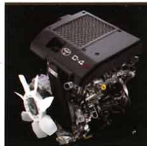
New Engine 1KD-FTV 3.0L D-4D Common Rail with Intercooler Turbocharger

Fortuner with the new bold exterior will give you the ultimate pleasure of driving. Leave the world behind with unmatched power and superior control.