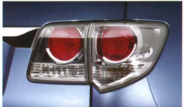
Rear Combination Lamps with wedge-cut inner lenses