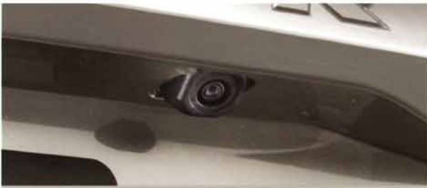
Rear Camera with Display for hassle free reverse parking

Designed with your well-being in mind, the Fortuner is equipped with effective active and passive safety systems like the ABS, GOA body, dual SRS airbags and head impact protection.