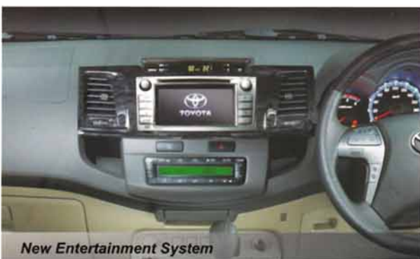
New Entertainment System