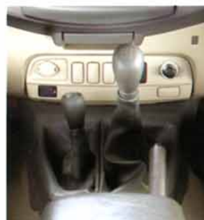
Full Time 4WD with 5-speed Manual Transmission allows you to master that much needed power to manoeuvre all types of terrain.