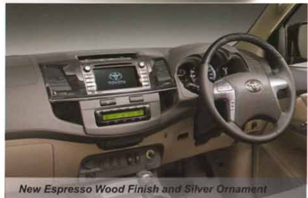
New Espresso Wood Finish and Silver Ornament