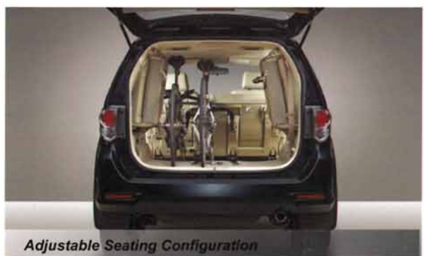
Adjustable Seating Configuration