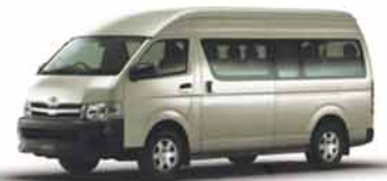
Silver White Mica Metallic <1E7>