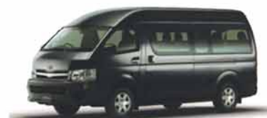
Dark Blue Mica Metallic <8P4>

*Addition of extra features may change figures in this chart. *Vehicle body colour may differ slightly from the printed photos in this brochure. *Vehicles pictures and specifications detailed in this catalog may vary from models and equipment available in Nepal.