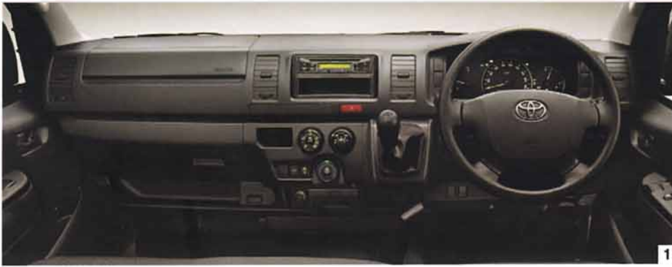
1. Instrument Panel featuring leather-like grain finishing