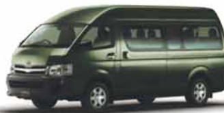
Dark Green Mica Metallic <6S3>