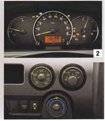
2. Combination Meter