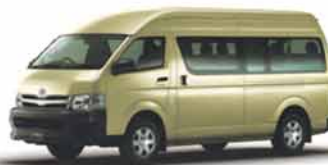
Light Yellow <599>