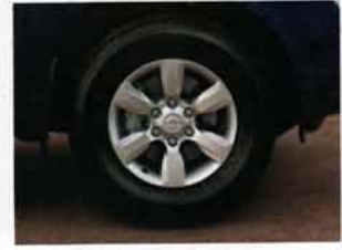
Stylish Alloy Wheels