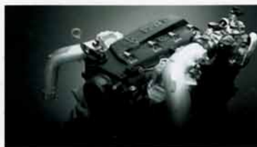
3.0L Turbo Diesel Engine