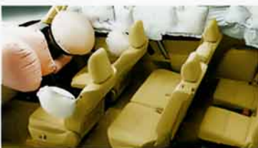
SRS Airbags (D&P, CSA, Side)