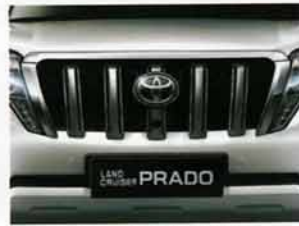
Aggressive Front Grille