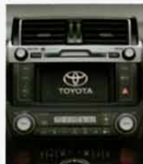
Touch Screen Audio Display