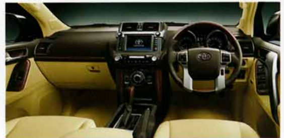
Easy and efficient Centre Console