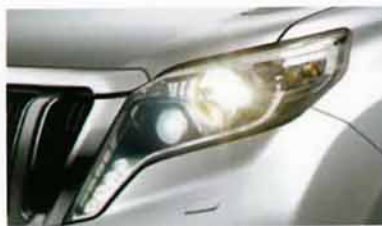
Daytime Running Lights