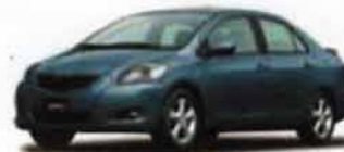
8R3 Grayish Blue Metallic