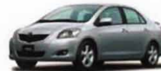
1E7 Silver Mica Metallic