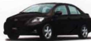
209 Black Mica

SRS front airbags help provide additional protection for the driver and passengers.