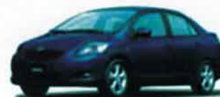
8T7 Blue Metallic