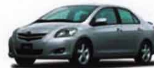
8N0 Blue Metallic