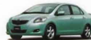
777 Turquoise Metallic