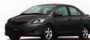
1E0 Dark Grey Mica