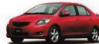
3R3 Red Mica Metallic